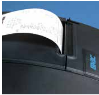
Liquid Guard Built Into the Cabinet Design