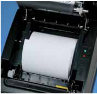
Drop and Print Paper Loading