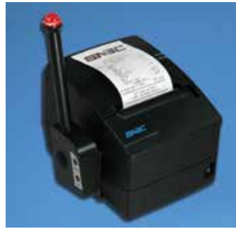
Optional Audio/Visual Print Messenger