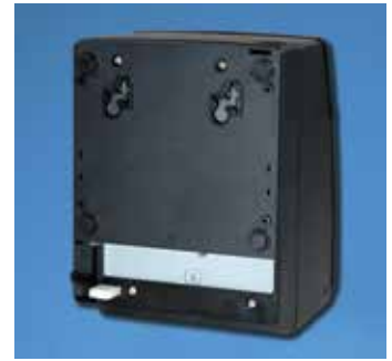
Built-In Wall Mount Capability