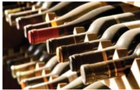
Pizza / Table Service / Quick Service / Liquor Stores