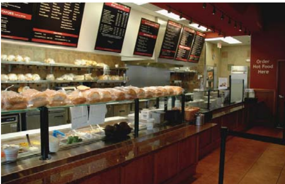
Cafeterias / Delis