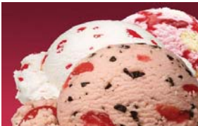
Bars / Ice Cream Parlors / Coffee Shops