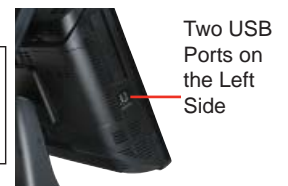
Two USB Ports on the Left Side

All product and company names are trademarks, service marks or registered trademarks of their respective owners. All features and specifications are subject to change without notice.